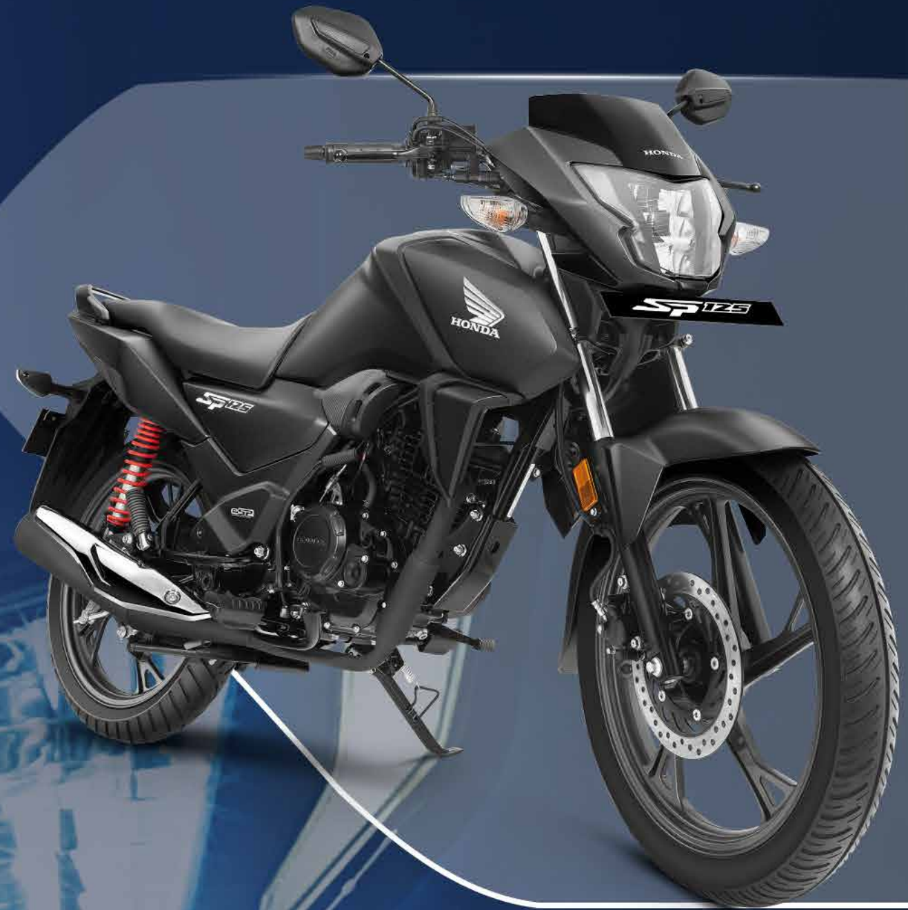
MAT AXIS GREY METALLIC